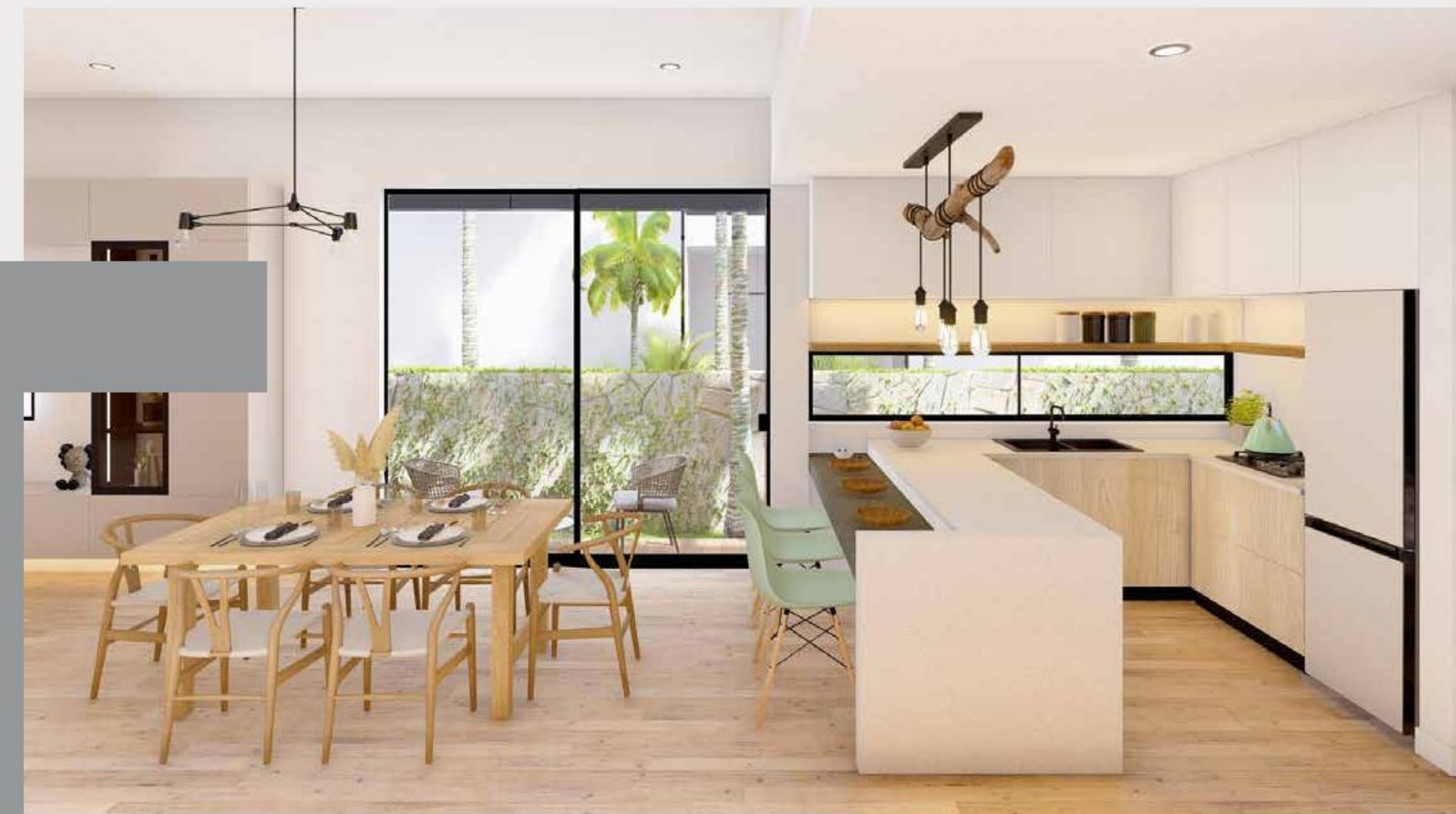
Kitchen with island | breakfast nook