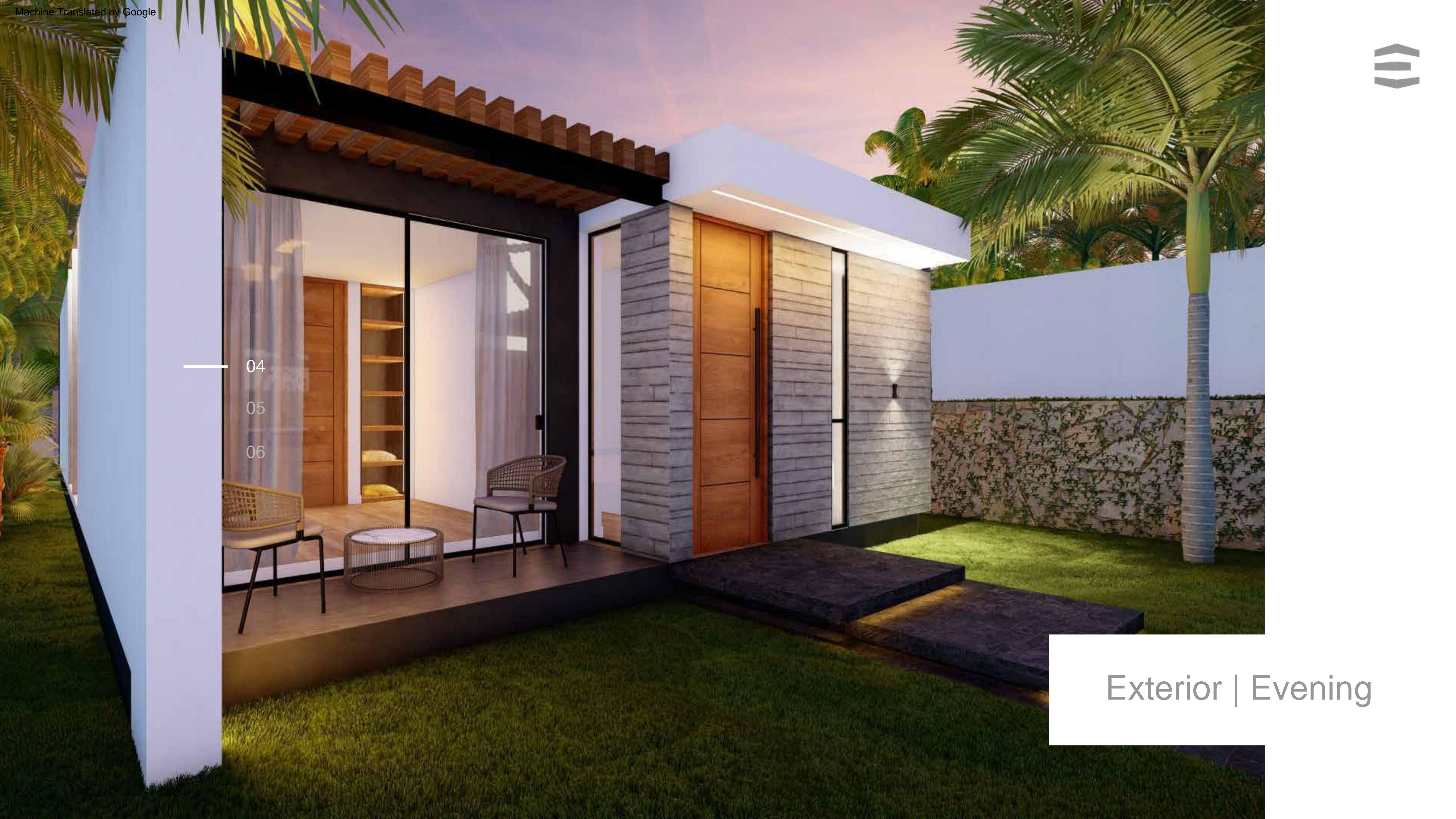
Exterior | Evening