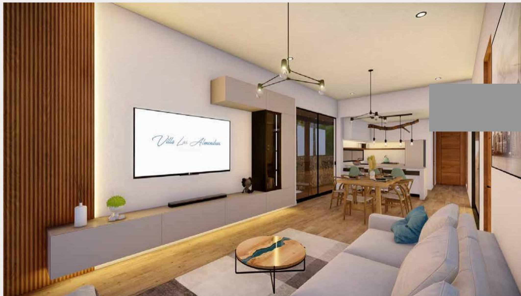
Room | Dining room

Environments designed for el confort y la elegancia.